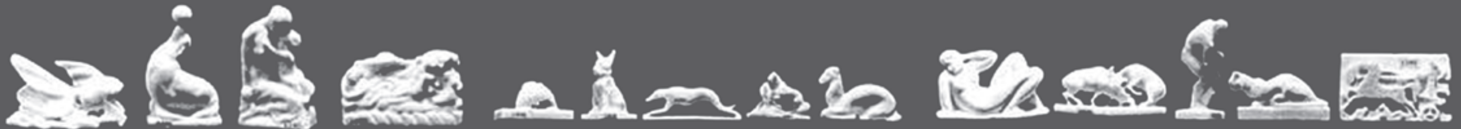
Edward Bernays' work for Procter & Gamble in 1923 was masterful. He invented a bogus survey showing a public preference for "unperfumed white soap." Ivory, made by the company, was the only such soap on the market.

1940s Public relations practitioners begin using opinion research techniques like the newly established Gallup Poll. The first