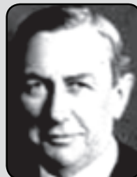
Public relations pitchmen of note (left to right): George Creel, Walter Lippmann, and Ivy Lee